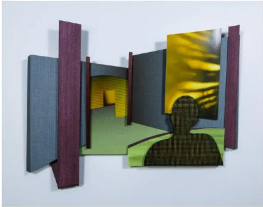
SCREEN SHOT #12